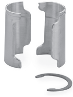
Aluminum Split Sleeve