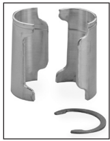
Aluminum Split Sleeve