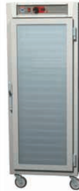
Full Height Full Clear Door