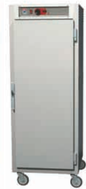
Full Height Full Solid Door