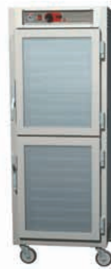
Full Height Dutch Clear Doors