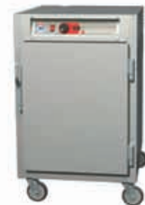
1/2 Height Full Solid Door