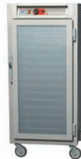
3/4 Height Full Clear Door