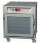
Under Counter Full Clear Door