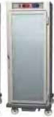
Full Height Full Clear Door