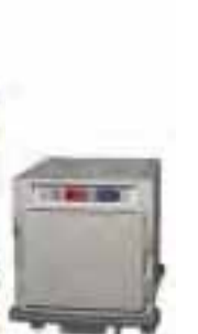
Under Counter Full Solid Door