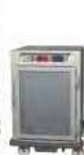
1/2 Height Full Clear Doors