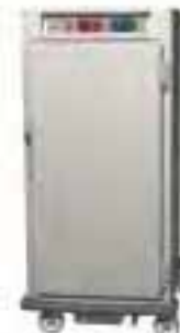
3/4 Height Full Solid Doors