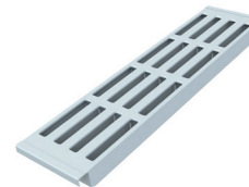
Open Grid Mat