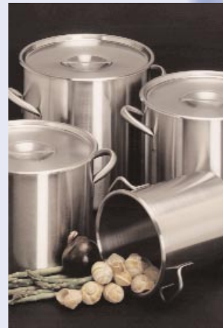
A. STOCK POTS with COVERS