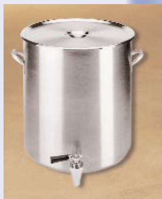
C. STOCK POTS with TWIST ACTION FAUCETS