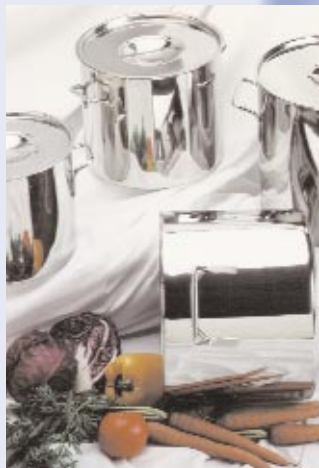
B. HEAT-RITE STOCK POTS with COVERS