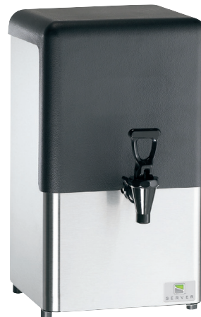
Mix-N-Serve® Butter Warmer/Mixer

Server's Mix-N-Serve® Butter Warmer/Mixer continuously stirs using a magnetic agitator to keep contents from separating. A removable melting basket suspends butter solids for replenishing throughout the day.