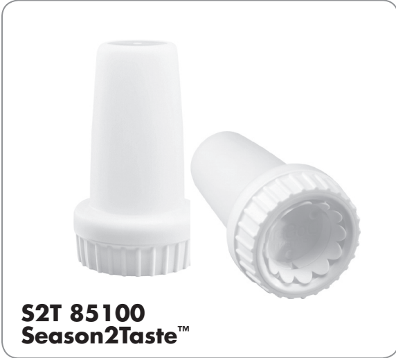
S2T 85100 Season2Taste™