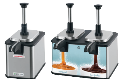
EZT-S & EZT short models

Models accommodate large and small operations, serving 1 or 2 toppings with or without the ability to pre-heat a reserve pouch; single unit also available without spout heater.