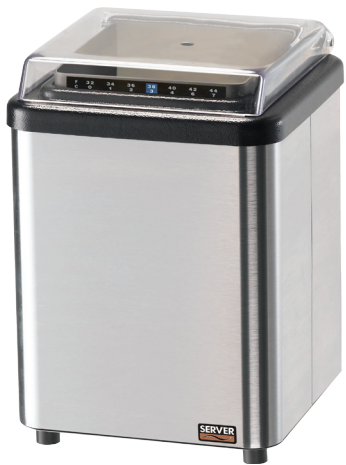
ECC 86063 Dairy Chiller