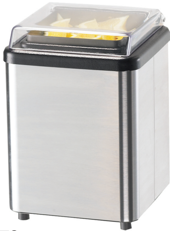
CC 86070 Countertop Chiller