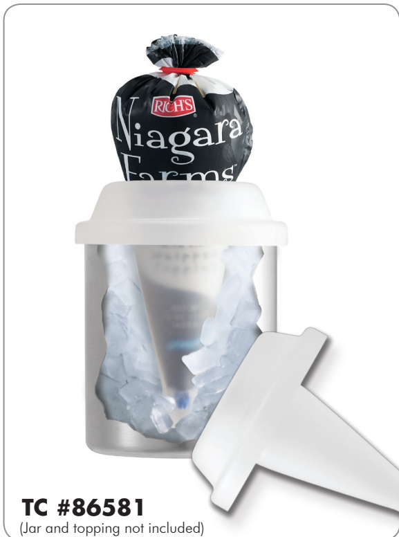
TC #86581 (Jar and topping not included)