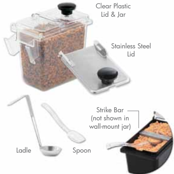
Strike Bar (not shown in wall-mount jar)