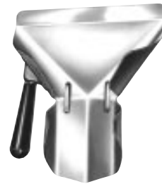
Model 152-ALN (Left-Handed)