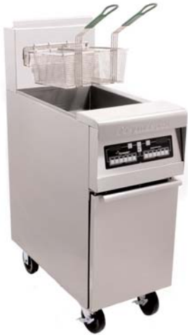
Shown with optional computer and casters