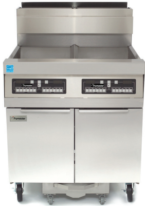
HD250 Shown with optional filtration and CM3.5 controller