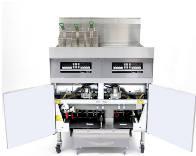
FPH265G Shown with optional computers, filtration and casters

*Matching cabinet required for optional filtration.