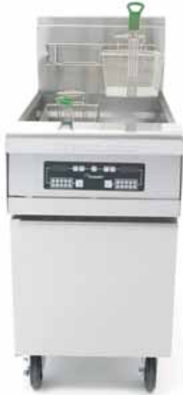
Shown with optional electronic timer controller and casters