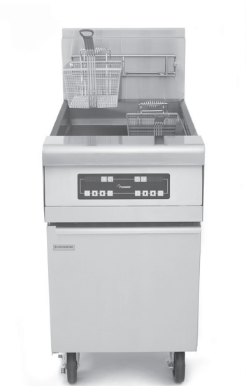
Shown with optional digital controller and casters