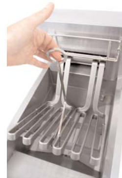
Combines swing-up elements with controlled burn-off cleaning (RE14 illustrated). Lift handle not available on 22 kW split pot element assembly.

This product incorporates technology developed for the Electric Power Industry under the sponsorship of EPRI, the Electric Power Research Institute.