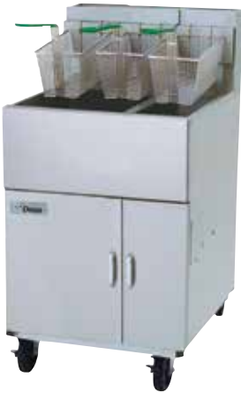
SM5020G Gas Fryer Shown with optional casters.