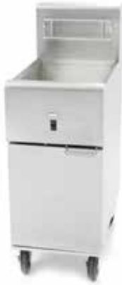
SR114E Shown with optional casters.