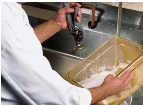
Nonstick surfaces for easy food release and cleaning.