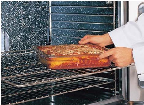
Hot pans are cool to the touch.