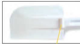
■ Clean-Rest™ reduces risk of cross-contamination.