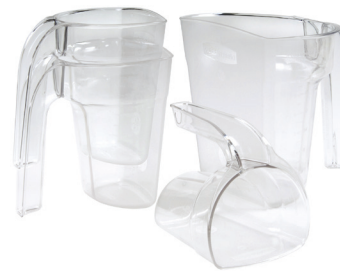
Nests for efficient storage.