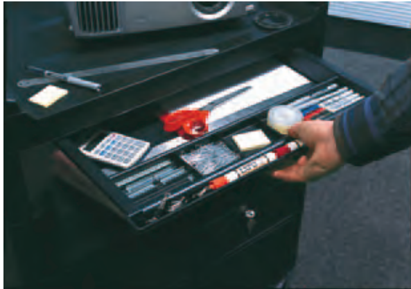
FG345700 Utility Cart includes lockable doors and sliding drawer.