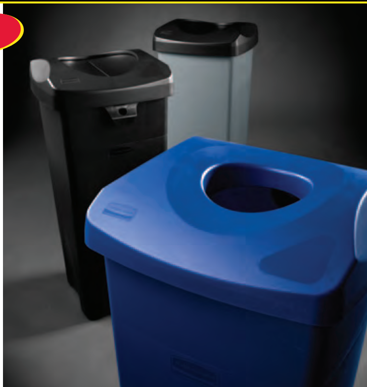
FG356988 / FG268988