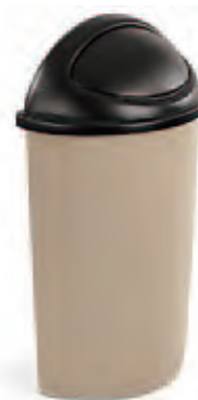
FG362000 / FG352000