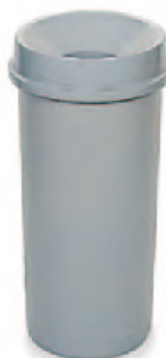
FG354800 / FG354600