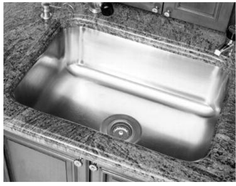
(There is a 1-1/4" flange on all 4 sides. We suggest leaving 3" clear in rear for rear mount faucet or faucet can also be mounted on corner.) Faucet Not Included