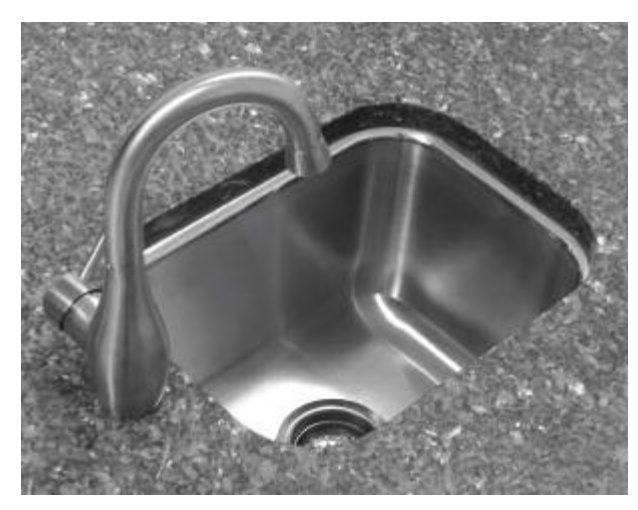
(There is a 1-1/4" flange on all 4 sides. We suggest leaving 3" clear in rear for rear mount faucet or faucet can also be mounted on corner.) Faucet Not Included