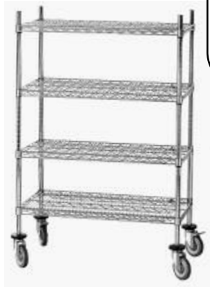
with Optional Casters