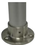
SG-1 For 1" Posts