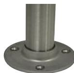
SG-2 For 1 5/8" Posts