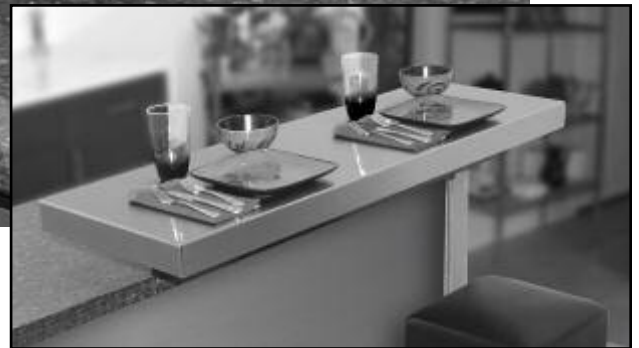
Mounts As a Cantilever Shelf for Added Serving Capability Shelves are sized for a 42" Bar Height