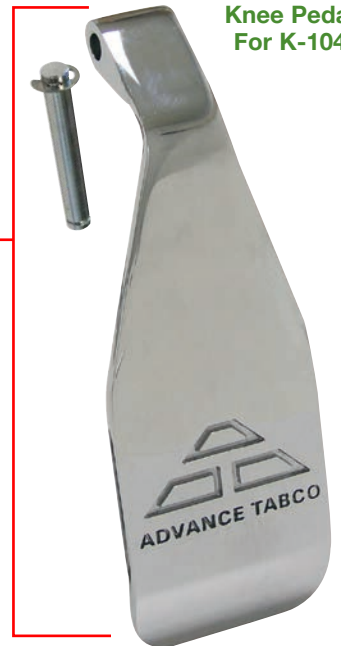
Chrome Plated Knee Pedal For K-104