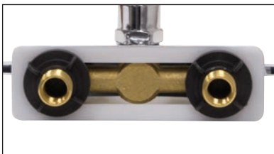
BOTTOM VIEW 1/2" NPS (OUTSIDE THREAD) 3/8" NPT (INSIDE THREAD)