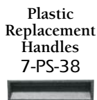
Plastic Replacement Handles 7-PS-38