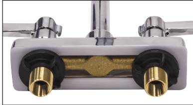
BOTTOM VIEW 1/2" NPS (OUTSIDE THREAD) 3/8" NPT (INSIDE THREAD)