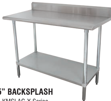
5" BACKSPASH KMSLAG-X Series