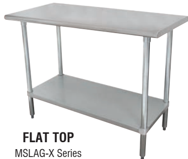
FLAT TOP MSLAG-X Series

LEGS: 1 5/8" diameter tubular Stainless steel. Stainless steel gussets. 1" adjustable stainless steel bullet feet.