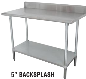
5" BACKSPASH KSLAG-X Series