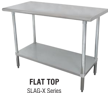
FLAT TOP SLAG-X Series

LEGS: 1 5/8" diameter tubular stainless steel. Stainless steel gussets. 1" adjustable stainless steel bullet feet.