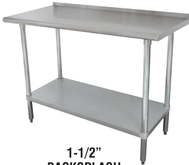
1-1/2" BACKSPASH SFLAG-X Series