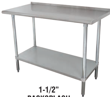
1-1/2" BACKSPASH SFLAG-X Series

LEGS: 1 5/8" diameter tubular stainless steel. Stainless steel gussets. 1" adjustable stainless steel bullet feet.