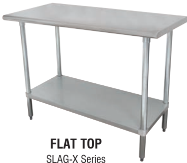
FLAT TOP SLAG-X Series