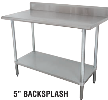
5" BACKSPASH KSLAG-X Series