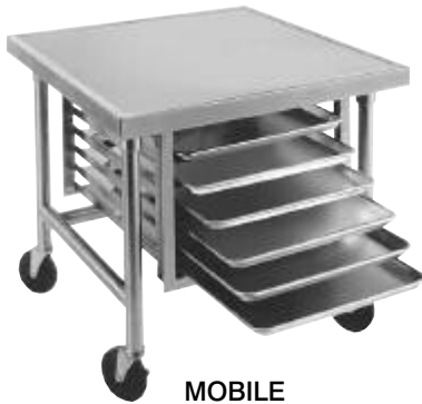
MOBILE MIXER TABLE