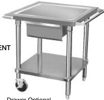
MIXER EQUIPMENT TABLE