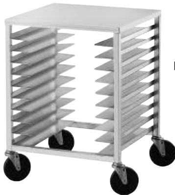
Half Size Rack

6063-T52 extruded aluminum angles, upright tubing, and support pieces.