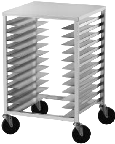
Pizza Pan Rack