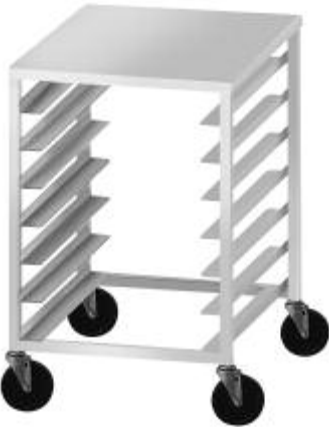
Pizza Dough Box Rack