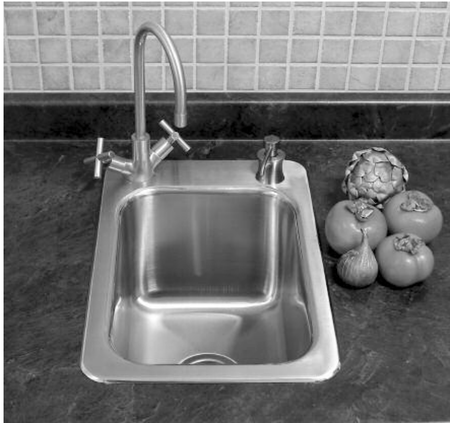
Above Shown with 2 Hole Faucet Modification (TA-472RE)