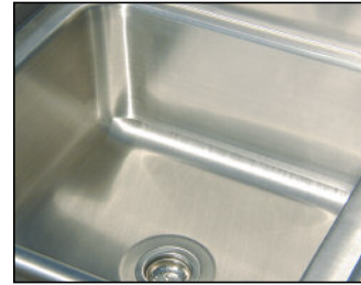
Deep Drawn Bowls are Seamless and Drawn out of a Single Sheet of Steel