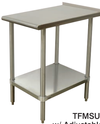
TFMSU Series w/ Adjustable Undershef