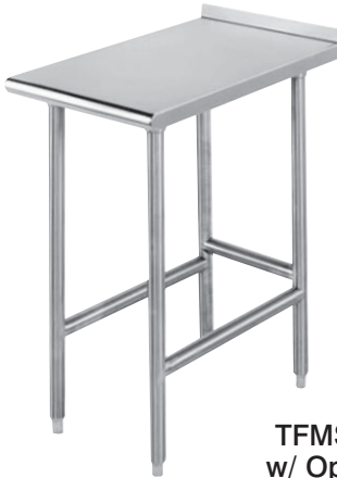
TFMS Series w/ Open Base