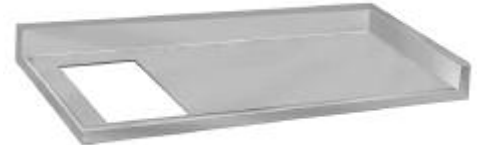
5" BACKSPLASH VCTF Series (Shown with optional side splash and cut-out)