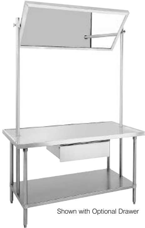
Shown with Optional Drawer