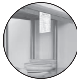
TA-77 Check Minder Provision On Any Shelf