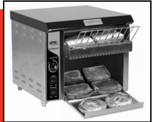
AT EXPRESS RADIANT CONVEYOR TOASTER