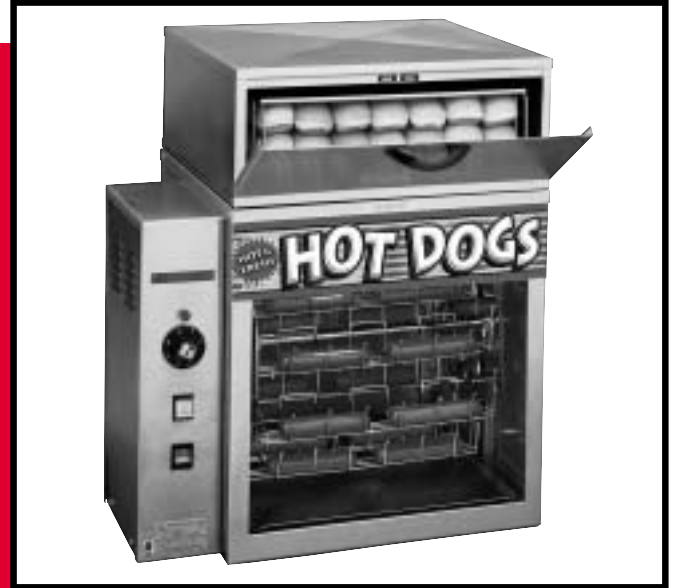
MODEL DR-2A HOT DOG BROILER WITH OPTIONAL BH-1A BUN HOLDER

* Please note: DR-1A and BH-1A are listed with UL, NSP and CSA as individual componets only, hot as the DR-2A package.