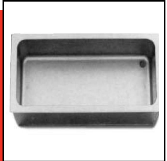
Model CFW-1 INSULATED COLD FOOD WELL

Units shipped with drain are provided with stainless steel NPT drain welded to bottom of pan and provided with removable screen.