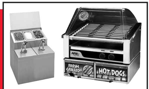
Hot Dog Package