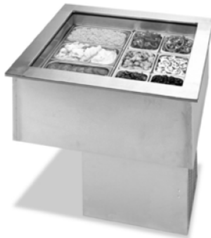
Model: Drop-In Cold Well